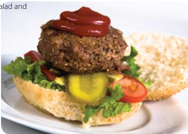
Hamburger and salad

If you have leftover mince use it to make meat balls or extra patties and freeze for another day.