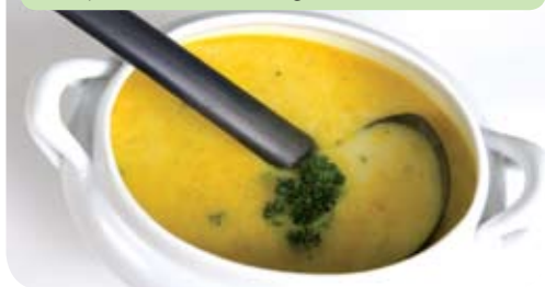
Potato and curry soup

Add extra vegetables such as cauliflower, beans, peas, silverbeet or spinach to make it go further.