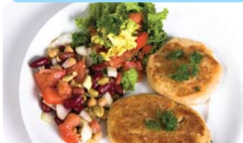
Mixed bean salad with fish patties

Try adding chopped orange segments and celery.